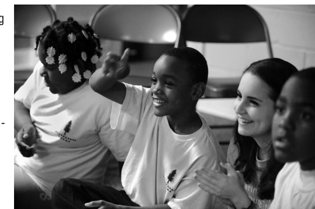
Wilderness Works kids enjoying volunteers

There were 39 of us that Friday night, March 14th. We had enjoyed being with a great group of students spending a week with Wilderness Works from Appalachian State University on their Alternative Spring Break. We had spent all of Sunday with this group of old friends and summer camp counselors up at Camp Evergreen cleaning up camp for Summer 08. The TODAY Show was up there filming our work. Tonight we had a big spaghetti dinner prepared by the ASU group. Now we were seated in the auditorium at Wilderness Works playing a group game. There were about 20 adults with us.